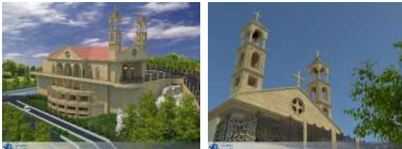
25- “Saint Rita church” – Kousba - North Lebanon