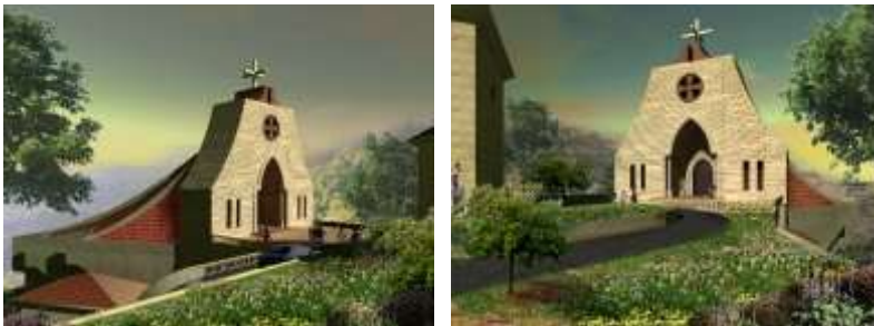
24- “Saint Martmoura church” – Karm Al Moher - North Lebanon