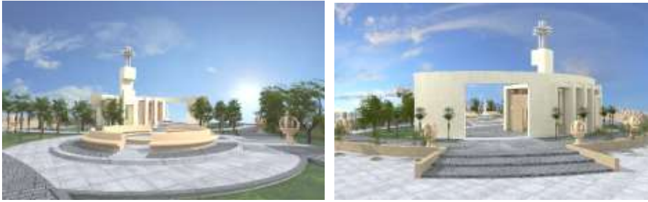
23- “Saint Saba Church” – Abdin- North Lebanon